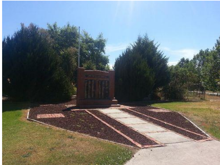
Mitta Valley War Memorial