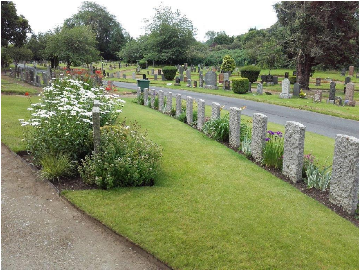
Tomnahurich Cemetery, Inverness, Scotland