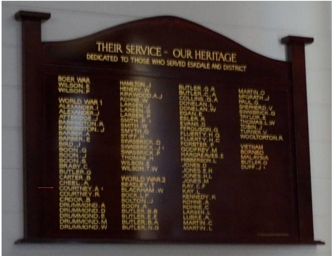
Eskdale & District Honour Roll