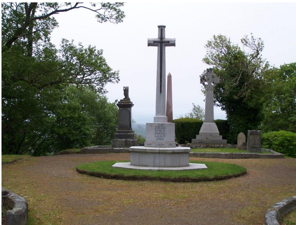
Cross of Sacrifice, Tomnahurich Cemetery, Inverness, Scotland

Tomnahurich Cemetery, Inverness, Scotland contains 162 War Graves. There are 89 War Graves from World War 1, with only 1 Australian from World War 1 & 1 Australian from World War 2 buried in the cemetery.